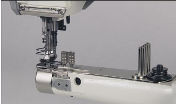
Global® WF1335B - Binding device

The WF 1345 is equipped with a large hook.