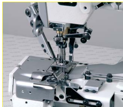
CB 2882 / 83 is equipped with a left hand knife