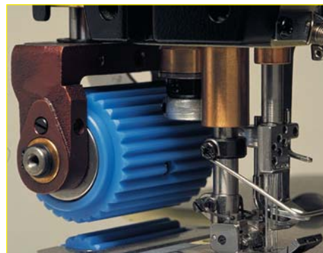
Global® model CB 2823 with puller