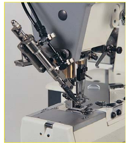
Pneumatic upper thread trimmer