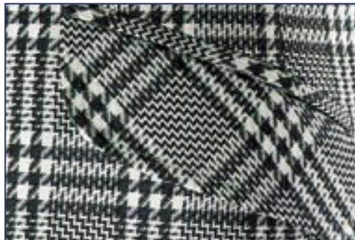
Slant pocket men's wear (PW 2045 SP)

Automatic lockstitch pocket welting machine suitable to sew a double welt, with or without flap.