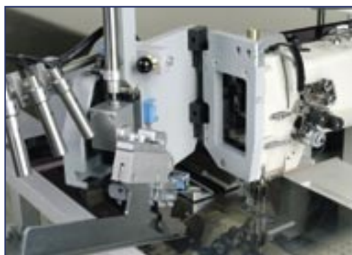
Head tilted back for quick and simple servicing and maintenance.