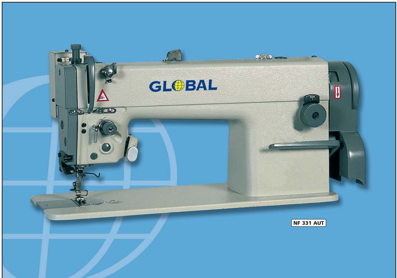
NF 331 AUT